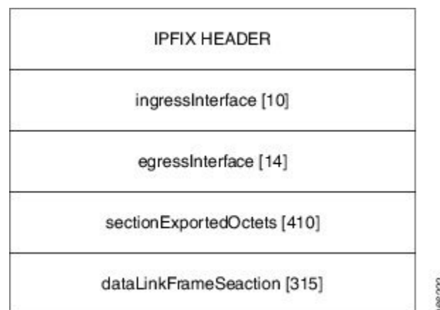
Figure 2: IPFIX 315 Export Packet Format

A special cache type called Immediate Aging is used while exporting the packets. Immediate Aging ensures that the flows are exported as soon as they are added to the cache. Use the command cache immediate in flow monitor map configuration to enable Immediate Aging cache type.