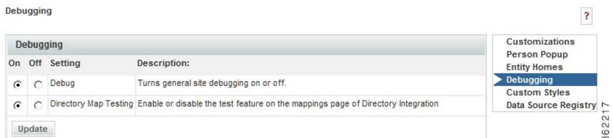
Figure 1: Debugging page

If an “Our Apologies” exception occurs, you may turn on “Debug” via the Debugging option of Administration module Settings.