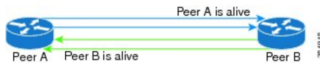
Figure 1: BFD Asynchronous Mode Without Echo Packets

When BFD is running asynchronously with echo packets (Figure 36), the following occurs: