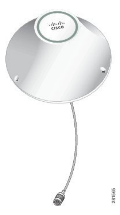
Figure 1: 4G Volcano Antenna