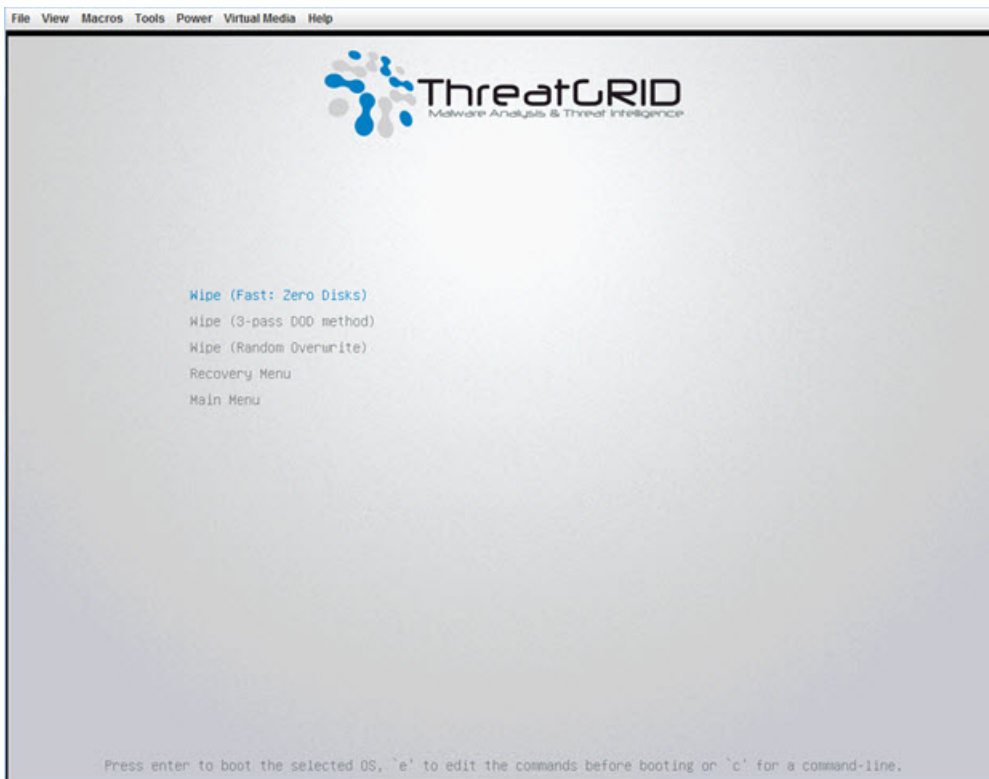
Figure 2: Wipe Options