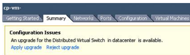
Figure 3: vSphere Client DVS Summary Tab

Step 2 Click the vSphere Client DVS Summary tab to check for the availability of a software upgrade.