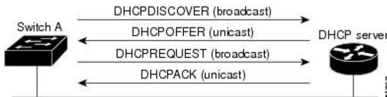
Figure 3: DHCP Client and Server Message Exchange

The client, Switch A, broadcasts a DHCPDISCOVER message to locate a DHCP server. The DHCP server offers configuration parameters (such as an IP address, subnet mask, gateway IP address, DNS IP address, a lease for the IP address, and so forth) to the client in a DHCPOFFER unicast message.