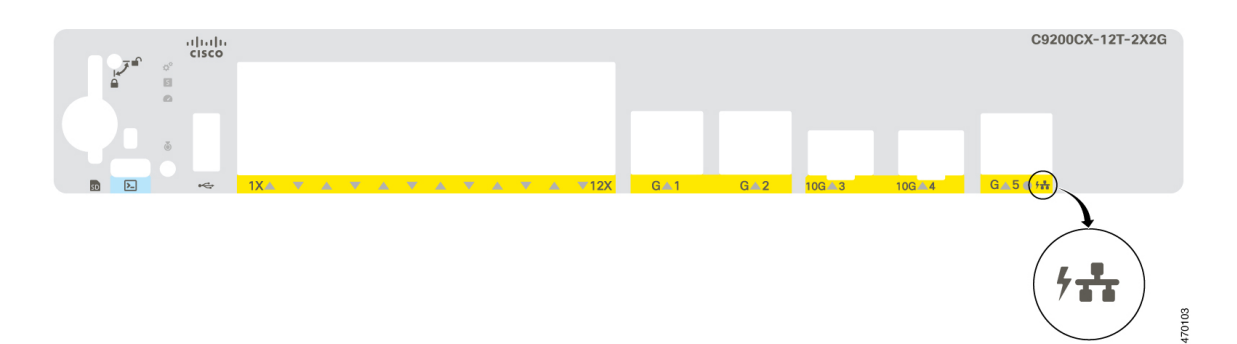
Table 4: PD Power LED

The PD Power LED indicates the status of the additional LED under the PD port of C9200CX-12T. Figure 1: PD port LED on C9200CX-12T