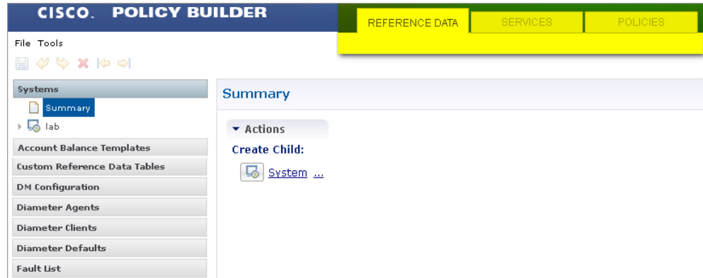
Figure 1: Cisco Policy Guilder GUI

aspects of the PB GUI as laid out in three tabs on the upper right of the interface: Reference Data, Services and Policies.