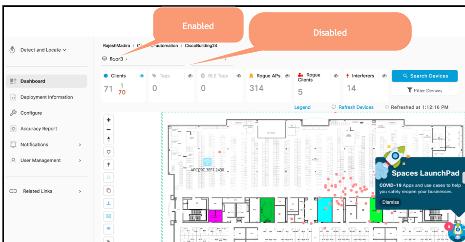
Figure 3: Check the Visibility Status of Device Types