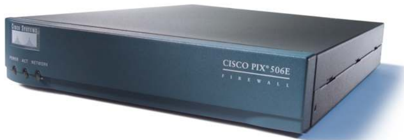
Cisco PIX 506E Security Appliance