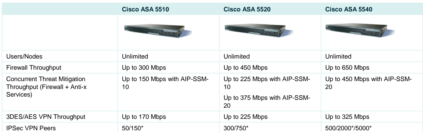
Table 4. Characteristics of Cisco ASA 5500 Series Adaptive Security Appliances

See Table 4 for characteristics of the Cisco ASA 5500 Series Adaptive Security Appliance.