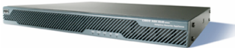
Figure 1. Cisco ASA 5500 Series Adaptive Security Appliance

The Cisco ASA 5500 Series helps businesses more effectively and efficiently protect their networks while delivering exceptional investment protection through the following key elements: